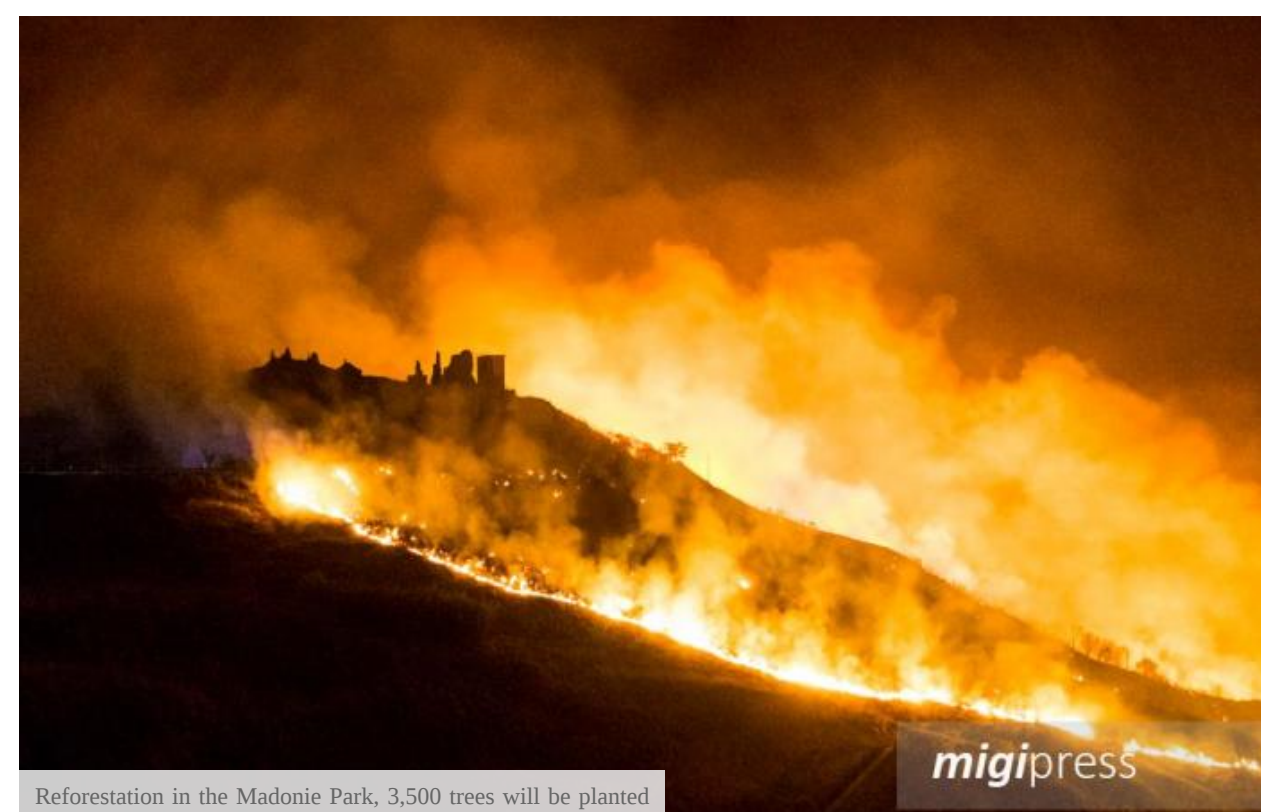
Reforestation in the Madonie Park, 3,500 trees will be planted